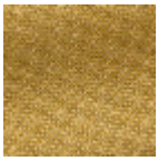
L4152_POINT_ DE_TOURS_B3 2