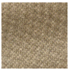
L4152_POINT_ DE_TOURS_B7 0