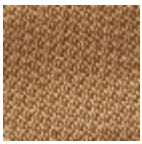
L4152_POINT_ DE_TOURS_B5 7