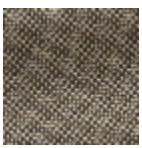
L4152_POINT_ DE_TOURS_B9 3