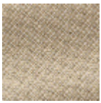
L4152_POINT_ DE_TOURS_B8 8