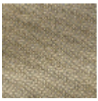
L4152_POINT_ DE_TOURS_B0 6