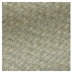
L4152_POINT_ DE_TOURS_B3 0