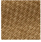
L4152_POINT_ DE_TOURS_B2 8