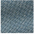
L4152_POINT_ DE_TOURS_B2 1