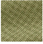
L4152_POINT_ DE_TOURS_B2 3