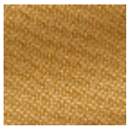
L4152_POINT_ DE_TOURS_B5 8