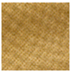
L4152_POINT_ DE_TOURS_B5 6