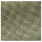
L4152_POINT_ DE_TOURS_B3 1