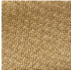
L4152_POINT_ DE_TOURS_B2 9