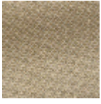
L4152_POINT_ DE_TOURS_B1 9