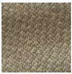
L4152_POINT_ DE_TOURS_B7 1