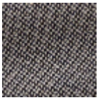
L4152_POINT_ DE_TOURS_B3 8