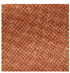
L4152_POINT_ DE_TOURS_B9 2