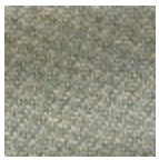
L4152_POINT_ DE_TOURS_B4 5