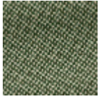
L4152_POINT_ DE_TOURS_B2 2