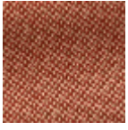
L4152_POINT_ DE_TOURS_B1 7