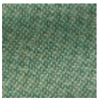
L4152_POINT_ DE_TOURS_B7 3