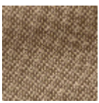
L4152_POINT_ DE_TOURS_B9 4