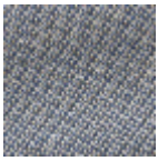
L4152_POINT_ DE_TOURS_B4 2