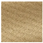
L4152_POINT_ DE_TOURS_B8 7