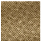
L4152_POINT_ DE_TOURS_B0 8