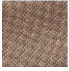
L4152_POINT_ DE_TOURS_B1 5