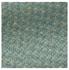
L4152_POINT_ DE_TOURS_B3 7