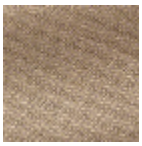
L4152_POINT_ DE_TOURS_B0 5