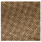
L4152_POINT_ DE_TOURS_B0 4