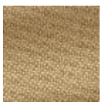
L4152_POINT_ DE_TOURS_B9 5