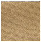
L4152_POINT_ DE_TOURS_B6 7