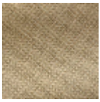
L4152_POINT_ DE_TOURS_B4 0