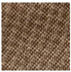
L4152_POINT_ DE_TOURS_B6 8