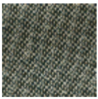
L4152_POINT_ DE_TOURS_B6 5