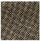
L4152_POINT_ DE_TOURS_B5 4