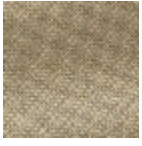
L4152_POINT_ DE_TOURS_B2 0