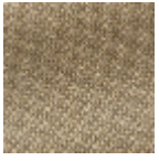
L4152_POINT_ DE_TOURS_B7 0