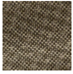
L4152_POINT_ DE_TOURS_B6 9