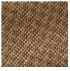
L4152_POINT_ DE_TOURS_B4 6