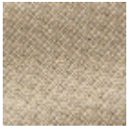
L4152_POINT_ DE_TOURS_B8 8