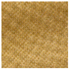
L4152_POINT_ DE_TOURS_B5 6