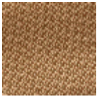
L4152_POINT_ DE_TOURS_B5 7