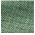
L4152_POINT_ DE_TOURS_B7 3