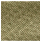
L4152_POINT_ DE_TOURS_B9 1