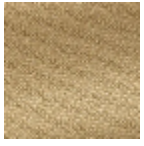
L4152_POINT_ DE_TOURS_B8 7