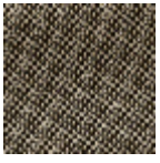
L4152_POINT_ DE_TOURS_B5 4