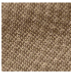
L4152_POINT_ DE_TOURS_B9 4